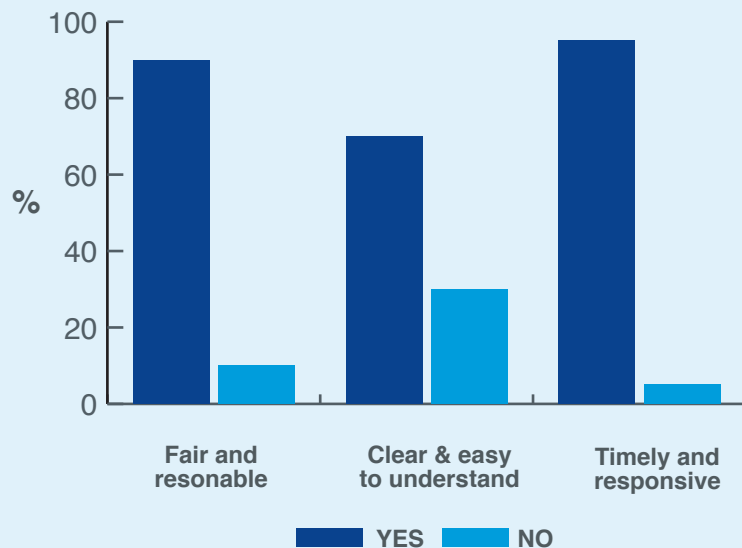
And overall when dealing with the NLA would you say we have been

Every month our customers give us feedback on our service. You'll find the most up to date results on our website and a snapshot on how we are doing below.